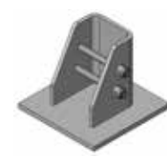
Weld Down Flange