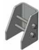
Weld Down No Flange