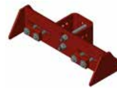
Concrete Rebar Clamp

Pass-through feature eliminates the need to frequently unhook the lanyard